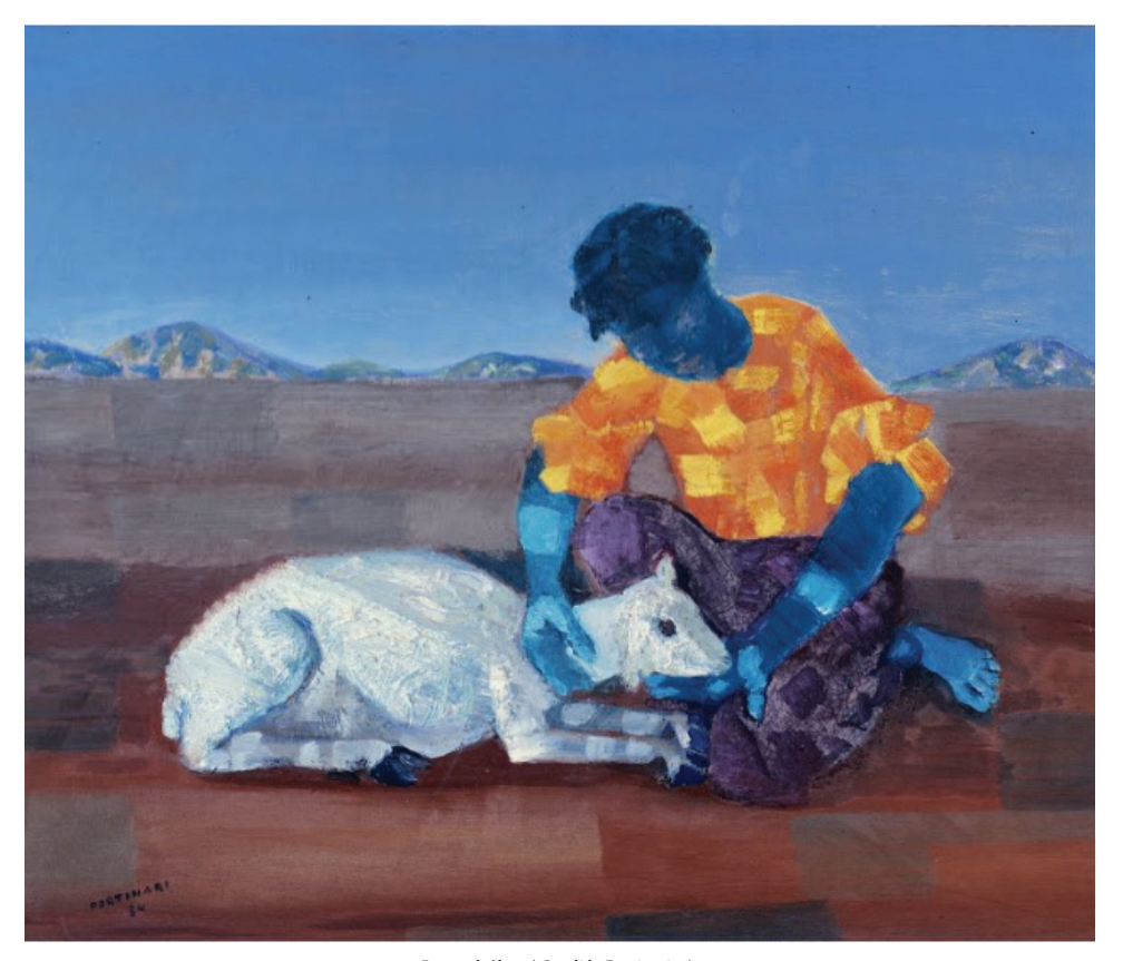
Boy with Sheep | Candido Portinari<br/>© | 1954

"I am the good shepherd. I know my own and my own know me . . . . "