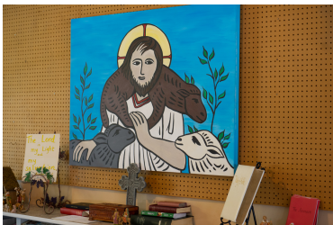
Top: Prayer tables are within each atria. Middle: Volunteers bring helpful hands. Bottom: Garage atrium at church property

As I contemplate the Kingdom of God and its mysterious growth I am heartened in reflection how the Kingdom of God has grown within our Catechesis offerings here at Church of the Lamb.