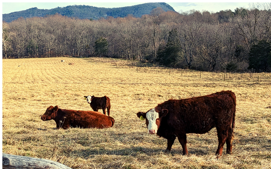
The cows have names! This is Irish Jo