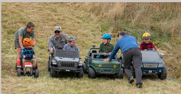
Annual Party 2022